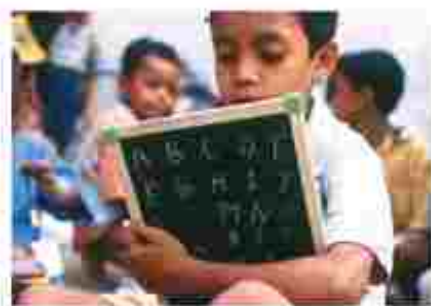
The Sector Committee Report also debunked other prevalent myths about Muslims. It is commonly believed that the Muslims prefer to send their children to Madrasas. The figures show that only 4 per cent of Muslim children are in Madrasas, where as 66 per cent attend government schools and 30 per cent private schools. (page 75)

In the above section of this chapter, we saw how in the case of the Muslim community there used to be a link between economic and social marginalisation. Earlier in this chapter, you read about the situation of Adivasis. In your Class VII book, you read about the unequal status of women in India. The experiences of all these groups point to the fact that marginalisation is a complex phenomenon requiring a variety of strategies, measures and safeguards to redress the situation. All of us have a stake in protecting the rights defined in the Constitution and the laws and policies framed to realise these rights. Without these, we will never be able to protect the diversity that makes our country unique nor realise the State's commitment to promote equality for all.