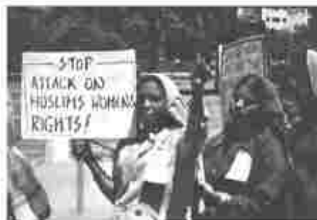
Muslim women are an important part of the women's movement in India.

to treat them differently and discriminate against them. This social marginalization of Muslims in some instances has led to them migrating from places where they have lived, often leading to the ghettoisation of the community. Sometimes, this prejudice has also led to hatred and violence.